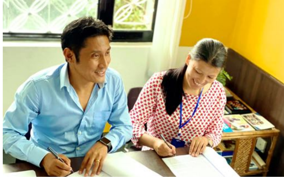
MOU signed with local government of Khumbu to support COVID 19 Education Response Project